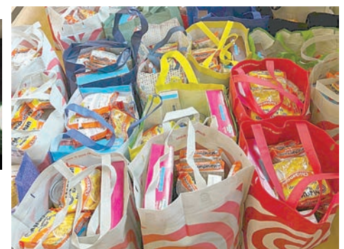
Our national project for backpacks help to feed a lot of the less fortunate kids to have food over their holiday break.