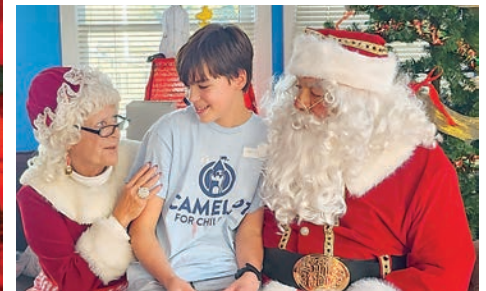
Santa and Mrs. Claus were at the Matching Fundraiser for Camelot for kids. They were beyond excited and we had a great time at Camelot for childrens Christmas party.