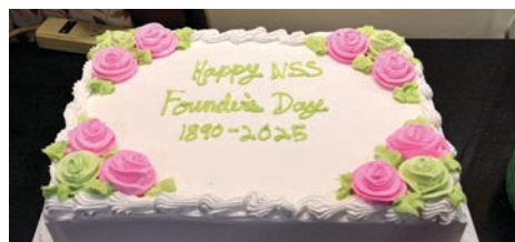
As in our past February meetings, after lunch attendees celebrate NSS Founders Day with cake.