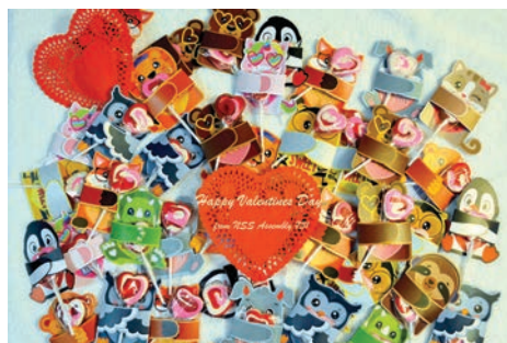
Valentines prepared by our youth members for nursing home residents.