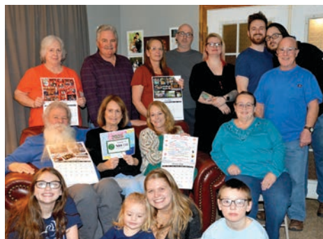
Some members gathered for a photo showing their new 2025 calendar.