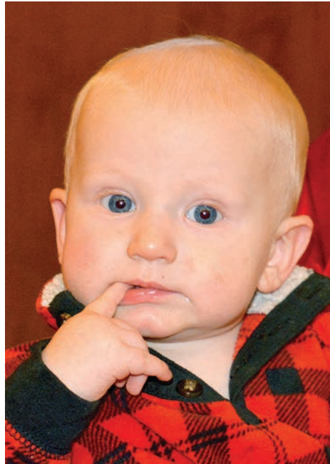
Winner of NSS sweatshirt.