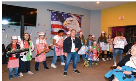
Entertainers use their instruments for songs.