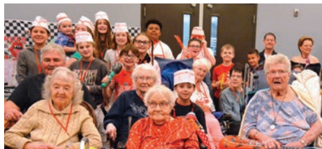
Women wearing their poodle skirts enjoying the 50's music and entertainment