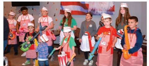
Youth from Assembly C731 and 4-H Club, "Rowdy Roosters" teamed up to entertain the residents of the Christian House with 50's music and dance to go along with the Soda Fountain theme.