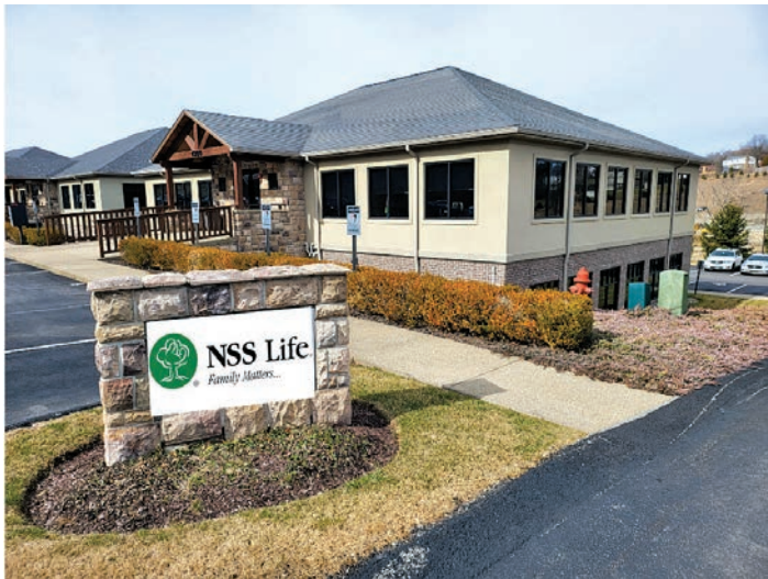
The view from the upper lot of our new NSS Life home office