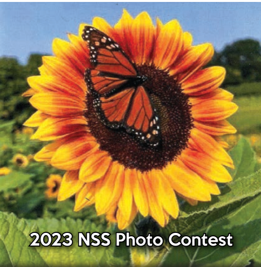
2023 NSS Photo Contest