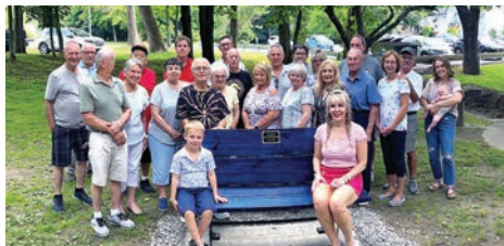
Members attending our annual picnic.