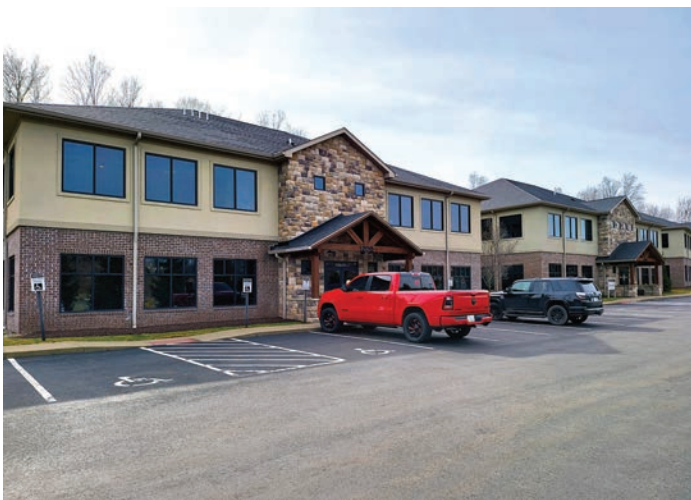
The view from the lower lot of both new NSS Life buildings