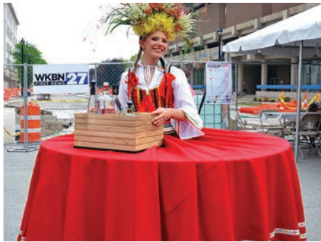
"Rosina" represents a family table where you could gather around for a shot of a favorite whiskey or vodka.