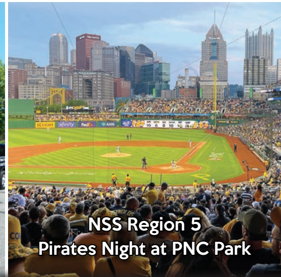
NSS Region 5 Pirates Night at PNC Park