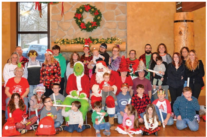
Some of the group gathered for a photo with Santa and Grinch