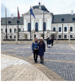
Bratislava Capital Building