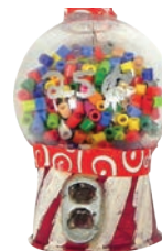
Snowflake Group – Ages 11-13 Bella Bernardo - Assembly C588