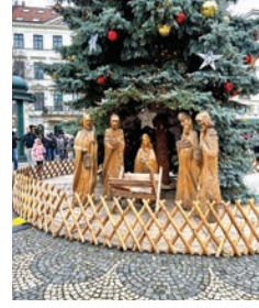
Christmas tree with nativity scene