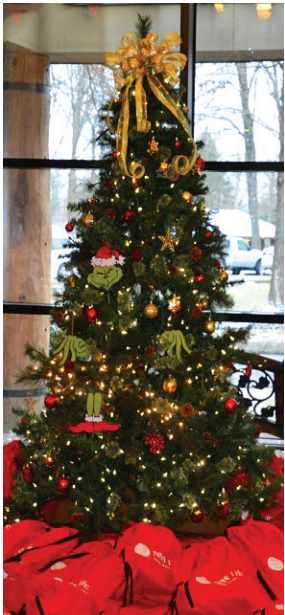
Assembly 731 Christmas Party tree - NSS gift bags waiting under the tree for Santa to give to the kids