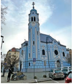
Church in Old Town Bratislava and represents Art Nouveau style of architecture and an active Hungarian-Secessionist Church.