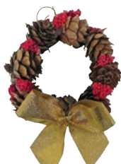
Santa Group – 14-16 Addison Draa - Assembly C731