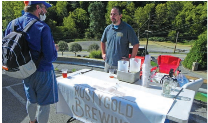
A representative from Rusty Gold Brewing company in Canonsburg provided complimentary servings of their beer during the festival