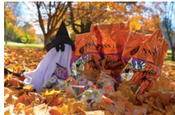
NSS bags and items we filled them with. Kids loved their goodie bags!