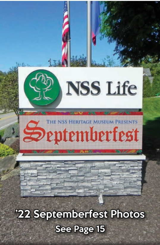
'22 Septemberfest Photos See Page 15