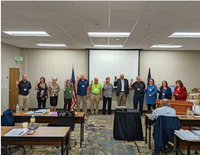
Newly elected officers being sworn in October, 2022.