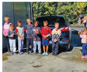
Hokey Eagles football league carwash fundraiser