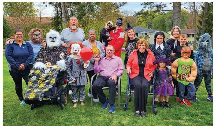
Members wearing costumes at A-L102 Halloween Party