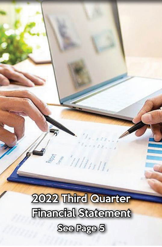
2022 Third Quarter Financial Statement See Page 5

Providing Fraternal Life Insurance Since 1890 | NATIONAL NEWS | DECEMBER 2022 | NUMBER 3572 | VOLUME 114