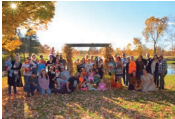
Assembly 731 members attending the Halloween Hayride.