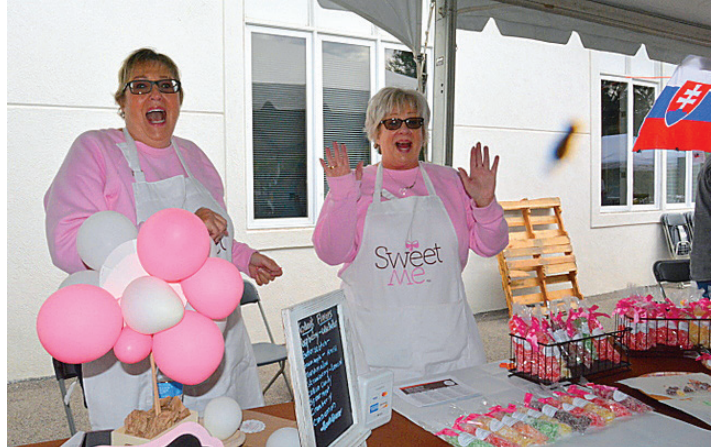
Representatives from "Sweet Me" selling sugar candies