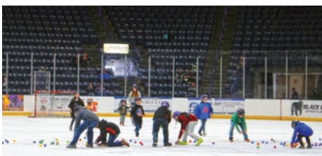
Gathering "sprinkles" from the ice to decorate the huge donut.