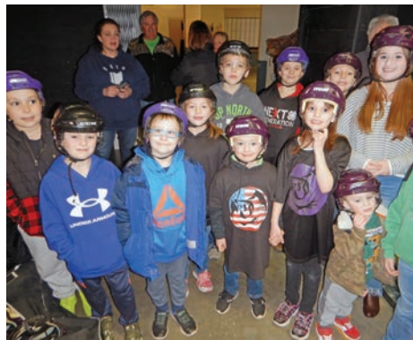
Kids are ready to hit the ice.