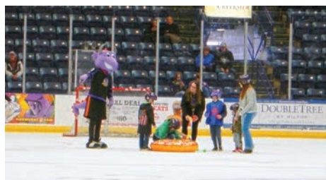
Delivering the "sprinkles" to the donut.