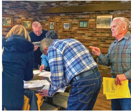
Members of Assembly 377 working on the election of delegates to the 38th Quadrennial Convention.