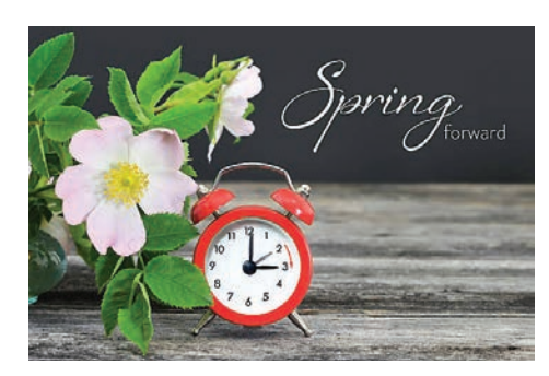
Don't forget to change all your clocks ahead one hour on March 13th and also your batleries in your smoke alarms.