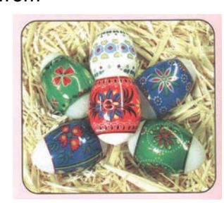
Old World Designs