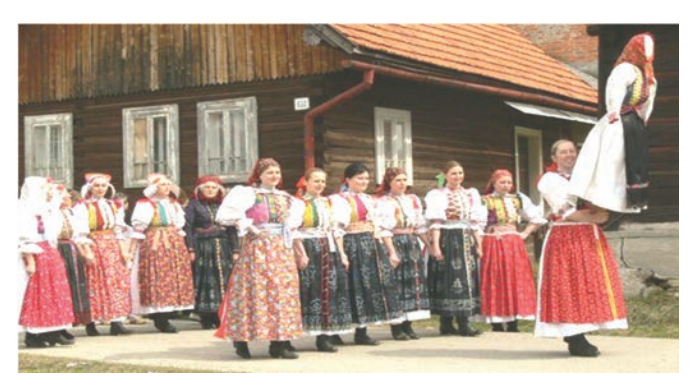
Vynášanie murieny a vítanie jari

Aké je počasie na Popolcovú stredu, také je po celý rok.