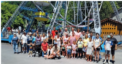
Group picture of members and guest at A-617 Fraternal Day

Fraternal Day for Assembly 617/C617 was held at Knoebels Amusement Resort in Elysburg Pennsylvania. The assembly provided hoagies, bottled water, and books of ride tickets to the members. Members also brought desserts and snacks to share with the group.