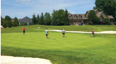
Hole #17 was home to the Hole-In-One challenge