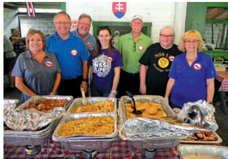
NSS employees among others volunteering their time at the Slovak Kitchen