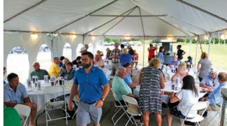
Closing out the tournament with the annual banquet