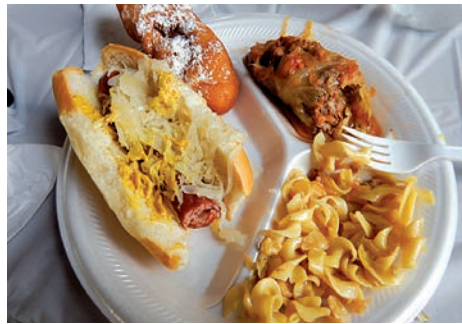
An example plate of food one could order: kielbasa, stuffed cabbage, haluski, and ceregi