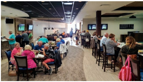
Fraternal Night: food, drinks, and virtual golf!