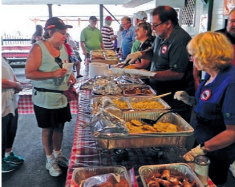
Many different options to choose from