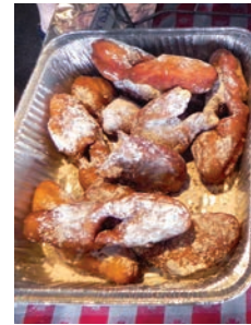
Ceregi with powdered sugar on top