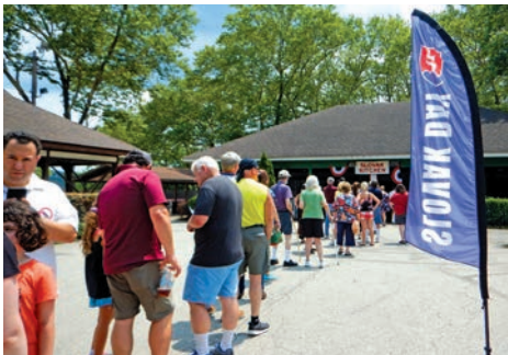
Long lines to purchase delicious Slovak food