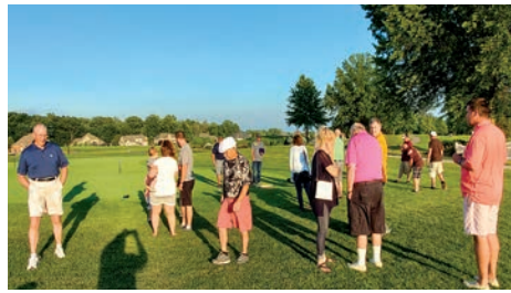
The annual putting contest was a bit cool but nonetheless an enjoyable evening