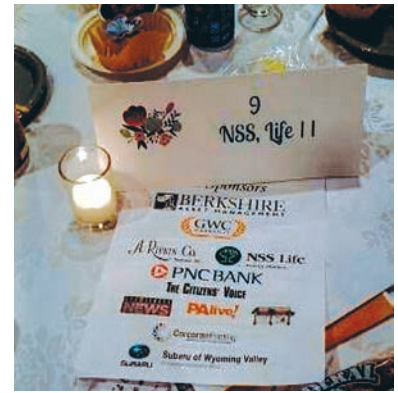
Region 2 Event Sponsorship Recognition

This event highlighted fabulous food from local restaurants and wineries throughout our community and live music. We had a "Purrfect" time at this event. Attending were 10 members from Assembly L075 and 2 members representing Region 2. The SPCA placed our name and logo on all publications at the event and in its video presentation. The region and assembly will sponsor this event again on November 1, 2020 so SAVE THE DATE.