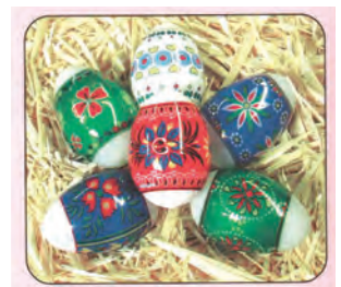
Old World Designs