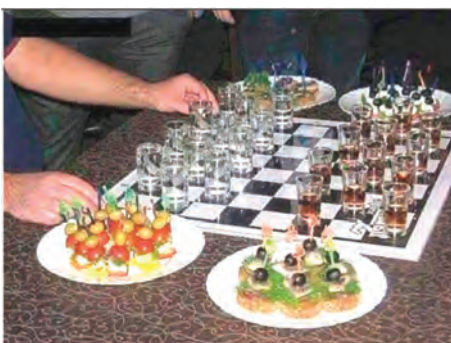
A game for playing on cold evenings instead of sitting in front of the computer!