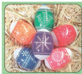
Slavic Pin Art