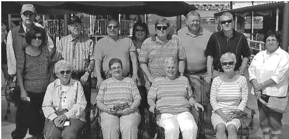
Members of Assembly 123 get together for a Gateway Clipper cruise of the river.