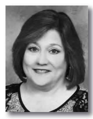
When you are a mother, you are never really alone in your thoughts. A mother always has to think twice, once for herself and once for her child. ~Sophia Loren