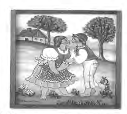
Máj – mesiac lasky.