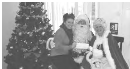
Santa and Mrs. Claus then surprised them with a visit to deliver their check.