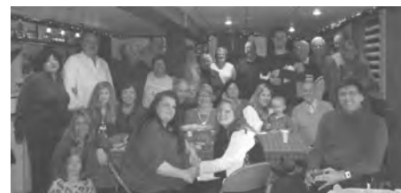
On January 11th, Assembly L102 held their annual Holiday Party. Great to socialize with everyone who braved the cold weather to be there.