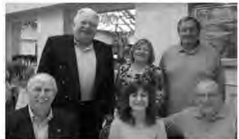
Zábery z bowling turnaju, 1-3 Maj 2015 Erie, PA