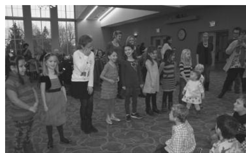
The girls lead the way to singing Christmas carols