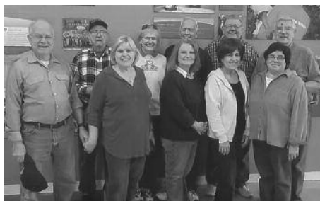
Members of Assembly 123 who volunteered at the World Vision Warehouse.