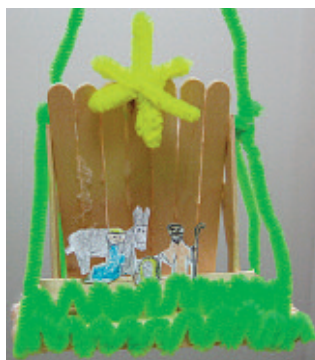
Angelina Ferary - C774 Ages 11, 12 & 13