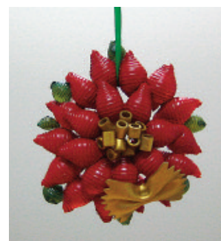
Charles Boone - C161 Ages 14, 15 & 16