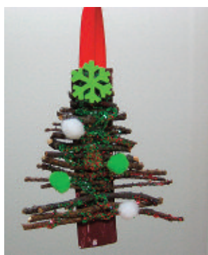
Carson Bernardo - C588 Ages 5, 6 & 7