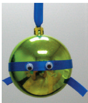
Adam Lazar - C075 Ages 8, 9 & 10