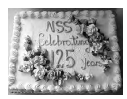
NSS Celebrating 125 years celebrated with birthday cake.