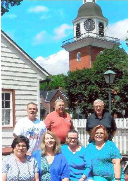
Members of our assembly enjoyed a beautiful day at Old Economy Village in Ambridge, PA.