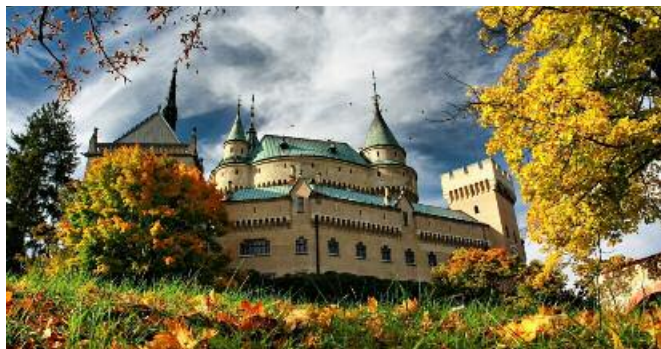
Jeseň v Bojniciach

~~~~~ 1. Lipa 2. Astronóm—venoval sa jej prof. I. Lipa 3. Clevelandská dohoda—podpísaná 22. októbra 1915. 4. Príbina—bol zrtaven prvým strednej a východnej Európe.