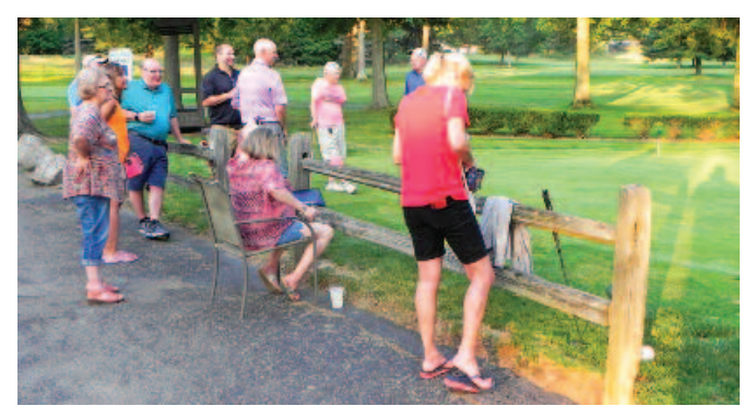
Fraternal Night Putting Contest