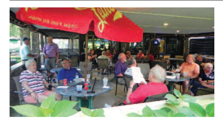
Fraternal Night Dinner