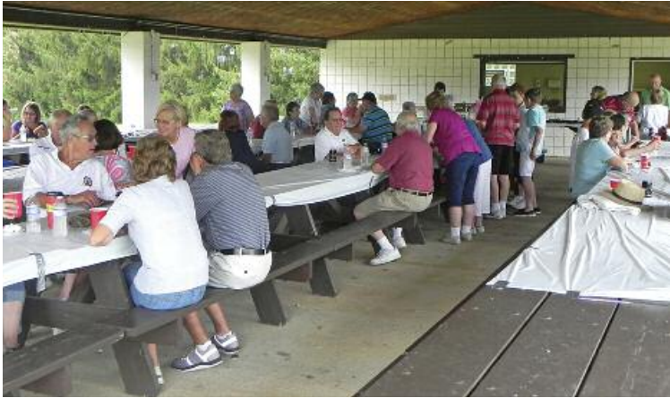
Region 5 members enjoying themselves at the Annual Picnic.