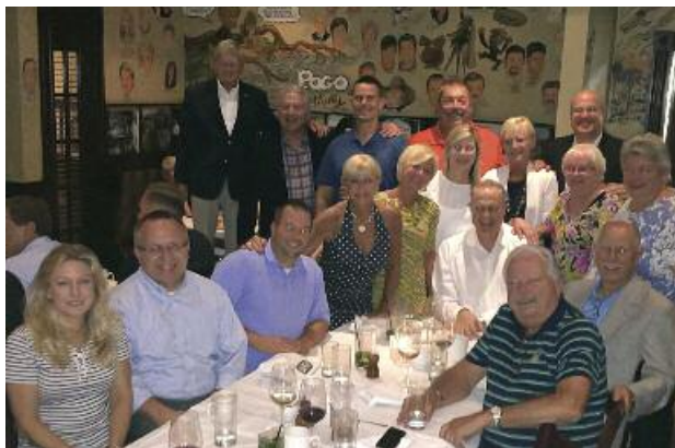
NSS Board of Directors and Executive Officers with their spouses attend a dinner at the 2016 Annual AFA Conference.