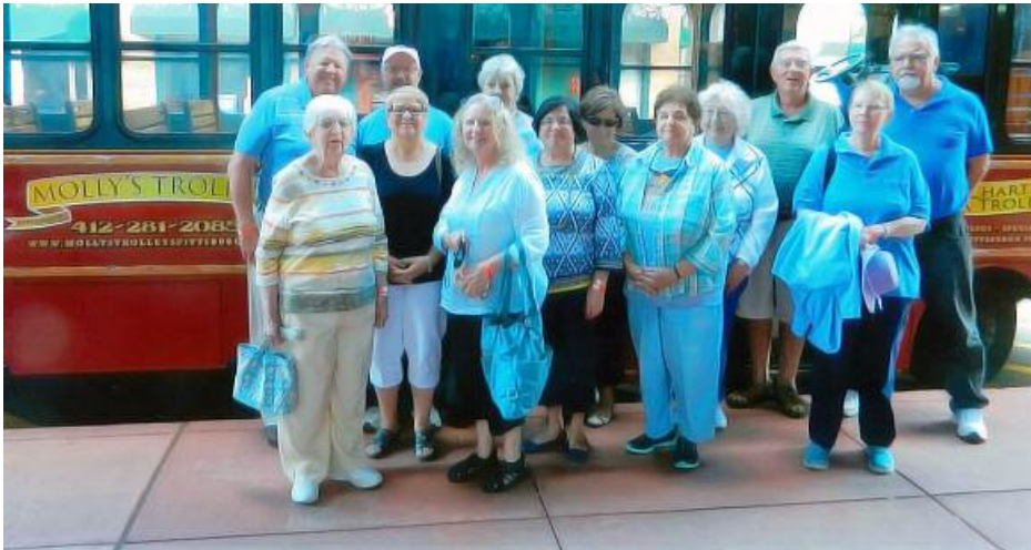
Members of Assembly 123 enjoyed a tour of Pittsburgh on Molly's Trolley on a beautiful day.