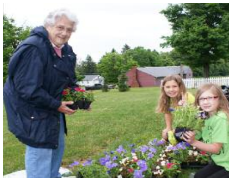
Join Hands Day. Planting flowers with members and Girl Scouts at the Poland Historical Society's Little Red Schoolhouse.