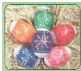
Slavic Pin Art