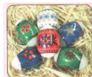
or Old World Designs