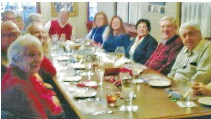
Assembly 123 members having a Christmas dinner together.