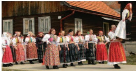
Vynášanie Murieny a víťanie jari

Keď v organizácii NSS slávime 127 rokov existencie pri tejto príležitosti ponúkame špeciálne ceny na životnú poistku cez mesiac marec. Jednoducho obráťte sa na hlavný úrad –nsslife.org.