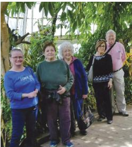
Members of Assembly 123 visiting Phipps Conservatory.

The 36th Quadrennial Convention was held at Hershey Lodge in Hershey, Pennsylvania, where the delegates voted to adopt new By-Laws changing the governance structure of the National Slovak Society, incorporating Board Governance. The nine newly elected Board of Directors members would be responsible for hiring the President and Secretary-Treasurer for the next four years.