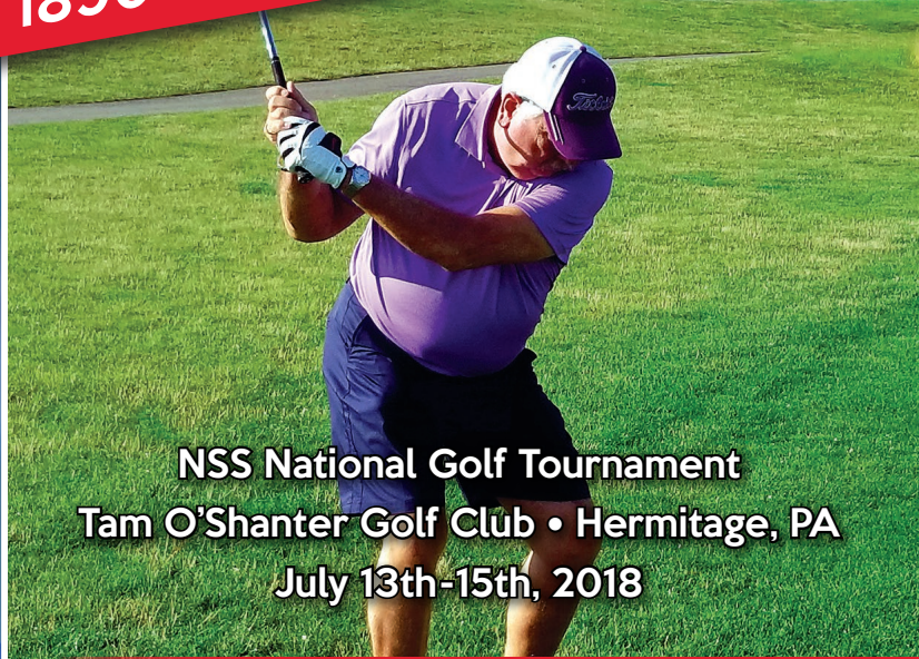
NSS National Golf Tournament Tam O'Shanter Golf Club • Hermitage, PA July 13th-15th, 2018

NATIONAL NEWS JULY 2018 | NUMBER 3519 VOLUME 110