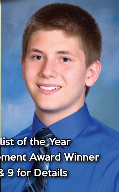
2018 Fraternalist of the Year 2018 Youth Achievement Award Winner See Pages 8 & 9 for Details