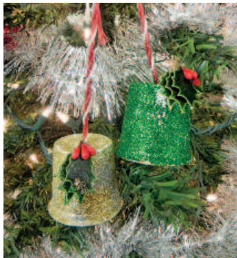
Jackson Ghaly Assembly C123 Frosty Group – Ages 5–7