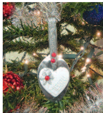
Randy Estes Assembly 731 Adult Members – 3rd Place