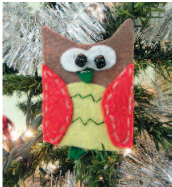
Abigail Herbster Assembly C434 Rudolph Group – Ages 8–10