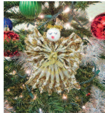
Charles Boone Assembly C161 Santa Group – Ages 14–16