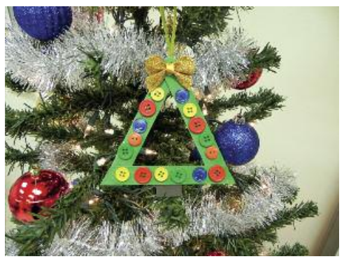
Ethan Knotts Assembly C595 Rudolph Group - Ages 8-10