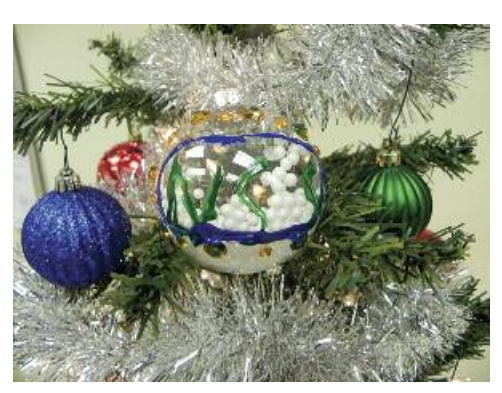
Adam Lazar Assembly CO75 Snowflake Group - Ages 11-13