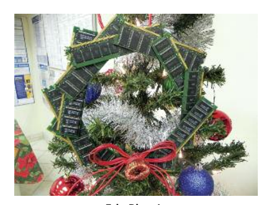
Eric Riepole Assembly 434 Adult Group - 3rd Place