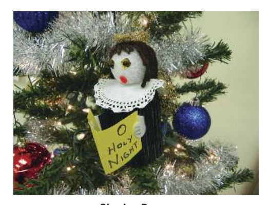
Charles Boone Assembly C161 Santa Group - Ages 14-16