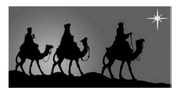
6. január Troch Králov

Vinšujem vám Nový rok, požehnaňia na každý krok. Do práce zdravička a na stôl chľebíčka. Do duše milosti. do srdca radosti. Pokoj ňech s vami prebýva a láska s vami ňech spočíva.