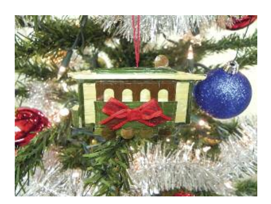
Maggie Semego Assembly 108 Adult Group - 2nd Place