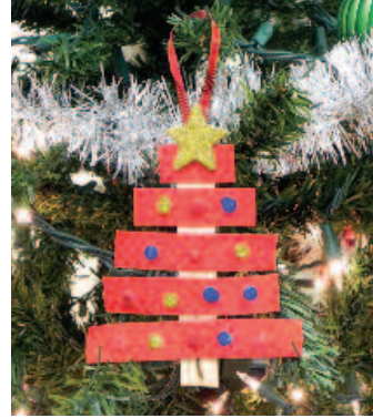
Ethan Knotts Assembly C595 Snowflake Group - Ages 11-13