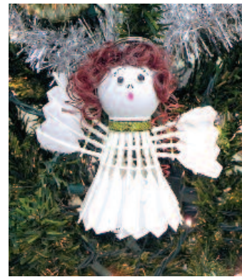
Sharon Wesnak Assembly L102 Adult Members - 3rd Place