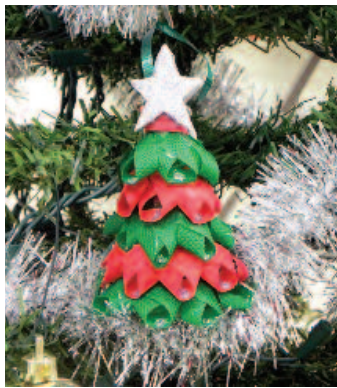
Lucy Piccoletti Assembly L075 Adult Members - 1st Place