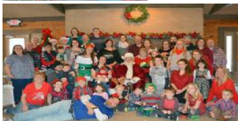
Everyone enjoyed celebrating Christmas together.