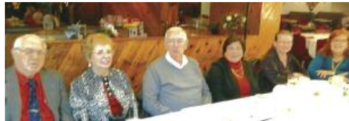
A wonderful time was had by all.