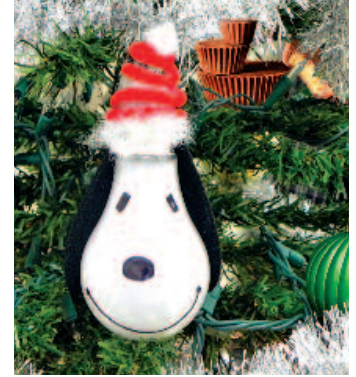
Jerzey Coble Assembly C554 Santa Group - Ages 14-16