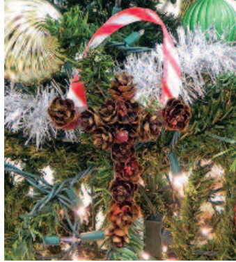
Greg Felton Assembly C434 Rudolph Group - Ages 8-10