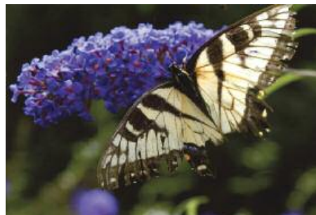
Animal: 2nd Place Ruth Burns - Assembly 731