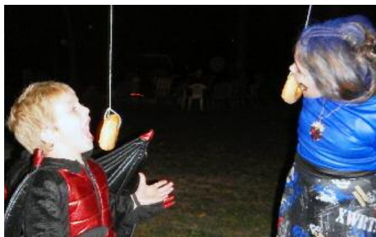
One of the games challenged the kids to eat a hanging donut...the adults also played this game with fun results.