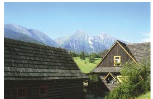
Scenic: 2nd Place Carole Ladue - Assembly L002