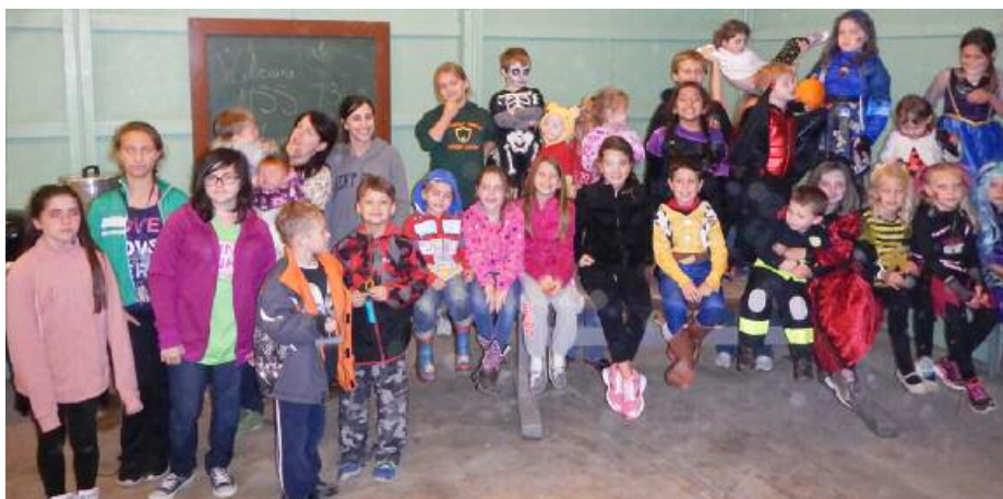
Youth members gather for a picture