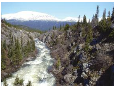
Scenic: 3rd Place Laurie Fox - Assembly 731