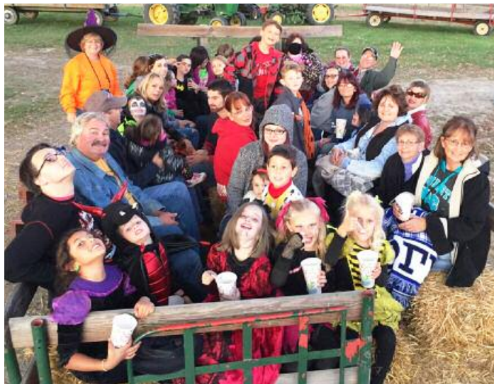
This is just one of our two wagons filled for the evening.

Assembly 731 sponsored their annual Halloween Hayride at Countryside Farms in Poland, Ohio. More than 50 members and friends enjoyed an evening filled with Halloween Fun. The family friendly hayride to the pumpkin patch gave everyone an opportunity to pick their own pumpkin before enjoying refreshments of sloppy joes, chili, cupcakes and hot chocolate on a cool October evening. Games kept the kids entertained after refreshments were served and everyone enjoyed socializing around the bonfire. Year after year, this has proven to be one of our most successful fun family events.