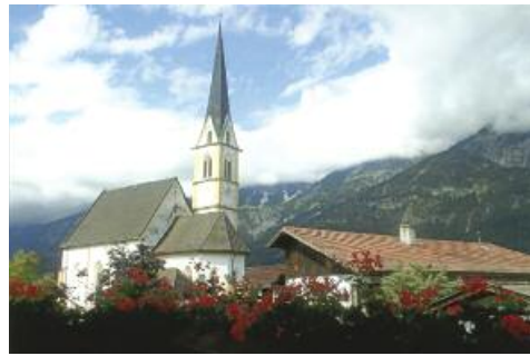
Scenic: 1st Place Carrie DeFelice - Assembly L102