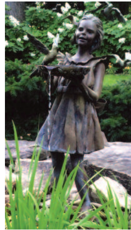
3rd place Convention - Daniel Farrell - 813