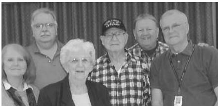
Members of Assembly 123 volunteer at the Veterans Hospital for bingo and pizza night.