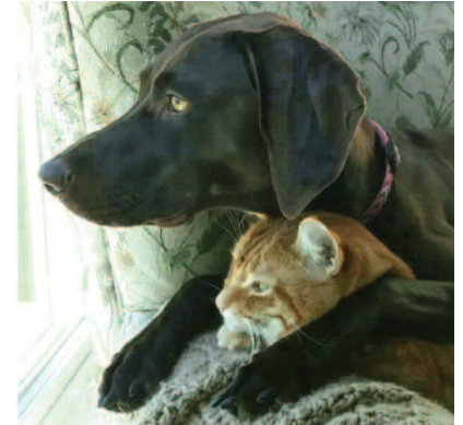
3rd place Animal - Susan Shuttleworth - 432