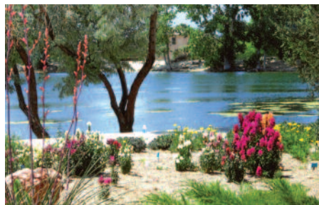
3rd place Scenic - Patricia Lafko - 434