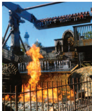
2nd place Scenic - Monica Boone - L161