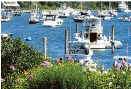
1st place Scenic - Jeanene Saniga - 377