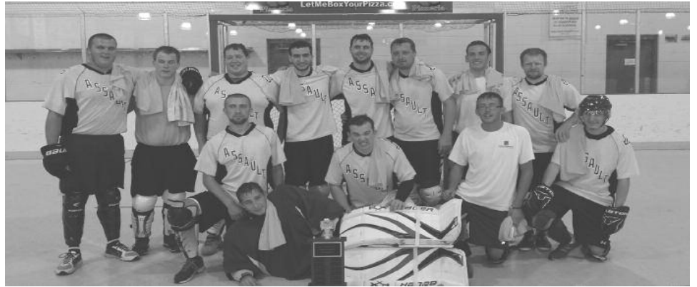
Members of the NSS Assembly 0039 that won the championship in their division.

The NSS Deck Hockey team "Assault" sponsored by Assembly 0039 has won another championship, in their division, at the Hot Shot Recreation Center in Mount Pleasant, PA. The assembly provided the bright green shirts the team wears that has the NSS Life name and logo on the back with each player's name. We congratulate them for another successful season and championship.