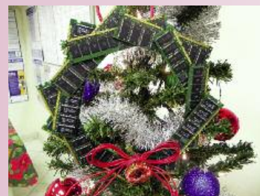
Eric Riepole - Assembly 434 Adult Group - 3rd Place