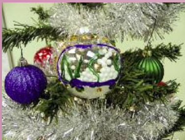
Adam Lazar - Assembly C075 Snowflake Group - Ages 11-13