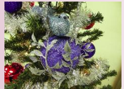
Natalie Skrypak - Assembly 377 Adult Group - 1st Place