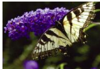
Animal: 2nd Place Ruth Burns Assembly 731