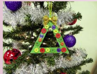
Ethan Knotts - Assembly C595 Rudolph Group - Ages 8-10