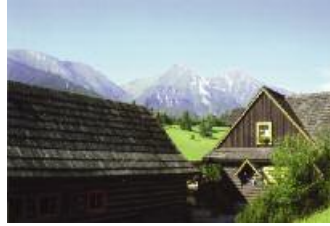
Scenic: 2nd Place Carole Ladue - Assembly L002