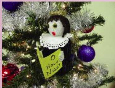
Charles Boone - Assembly C161 Santa Group - Ages 14-16