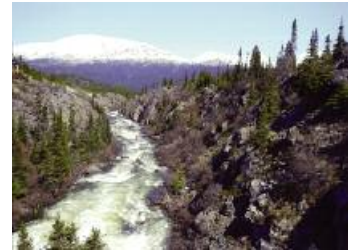
Scenic: 3rd Place Laurie Fox - Assembly 731