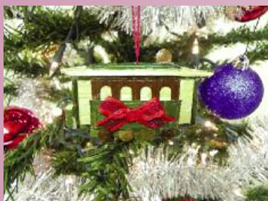
Maggie Semego - Assembly 108 Adult Group - 2nd Place